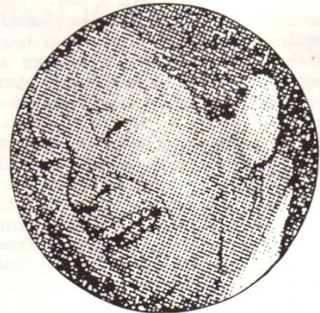
"CHINESE MANHOLE COVER"

TOO GREEN FOR PURPLE SO YOU WANT TO BE YOUR SISTER CONFESSIONS OF A FROZEN EAGLE HOLLOWED BE DAS PUPPETS GETTING THE MOST OUT OF A BURNING HOUSE BUGS THAT KEEP US MOVING HUMAN WOMEN HOGS THE LAVA COOKED DIZZY AND THE RIVER WIRES SO YOU THINK YOU'VE KILLED A PUMPKIN BRAIN WON'T LET ME CONSIDERING TERMITES?